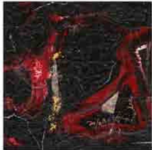
Sponsored and Presented by MK Gallery, KOWIN DC, and Kyunggi (H&H-School) Alumni Association of Greater Washington DC.